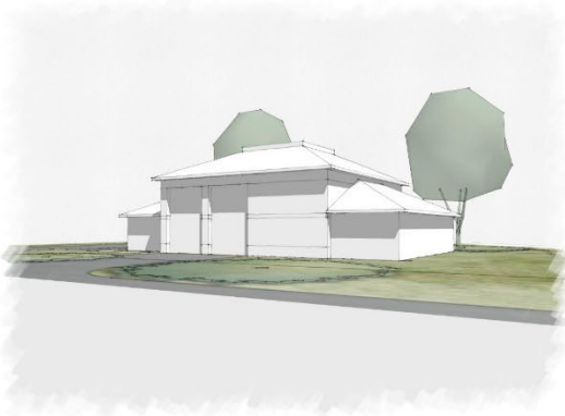
VIEW LOOKING NORTHWEST FROM W COUNTY LINE RD